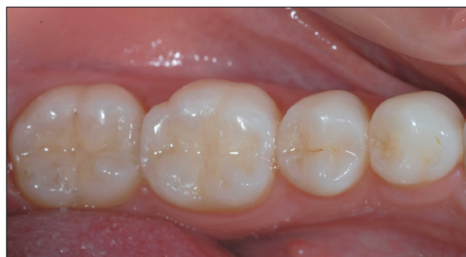
Figure 11. Post-operative occlusal view of the final restorations on teeth #18-21 at the one-week recall.

The essence of adhesive and prophylactic dentistry is to retain the maximum amount of sound tooth structure. The preserved dental tissue contributes to the residual strength of a tooth and represents the substrate for adhesion of resin composite. The marginal ridges of posterior teeth bear functional occlusal load due to their beamlike structure. Alternatives to conventional Class II preparations have been introduced over the years to provide maximum retention of tooth structure. The tunnel preparation and the bucco-lingual slot preparation became popular in the 1980s. 6