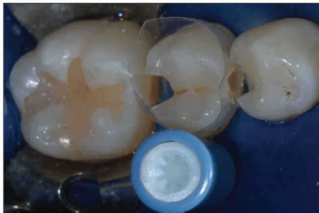
Figure 7. An ethanol-water based adhesive system was applied on both enamel and dentin.