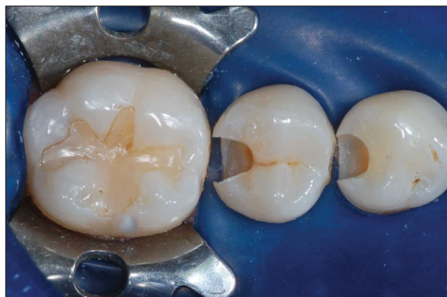
Figure 3. Occlusal view of cavity preparations showing preservation of the mesial marginal ridge on tooth #20.

to restore the mesial surface of tooth #20, following a previously described layering and curing protocol 5 (Figure 10). The rubber dam was removed, the occlu-