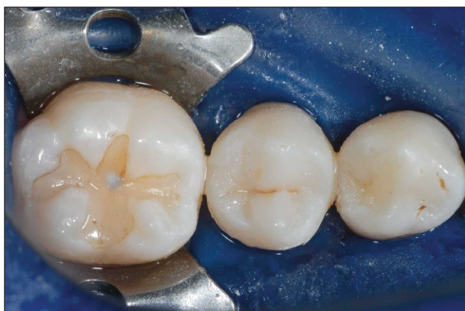
Figure 10. Once hybridization was performed, restorations were completed with the application of an A1 enamel shade to the proximal and occlusal surface and dentin shades to the remaining portion of the cavity.