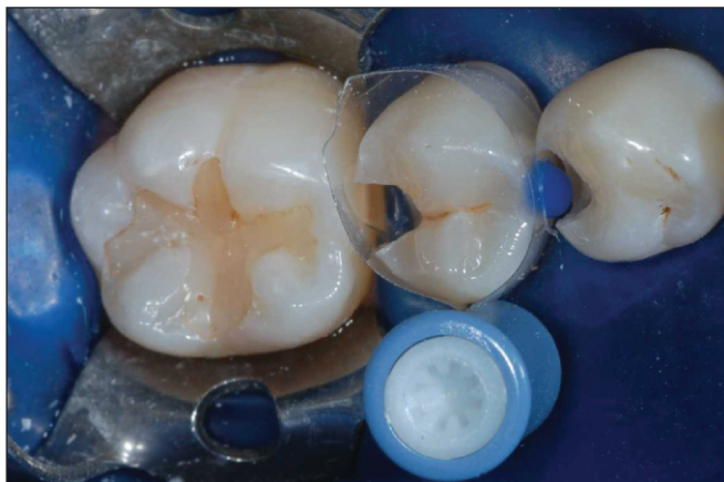
Figure 6. Etching was performed using 35% phosphoric acid.