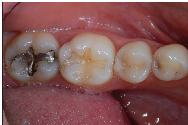
Figure 1. Pre-operative view of teeth #18-21 showing defective restorations and carious lesions.

At this point, sectional matrixes were placed on the remaining proximal surfaces still in need of restoration. Gingival adaptation was secured with wooden wedges (Figure 9). The restoration of teeth #20 and #21 was performed using the same materials adopted