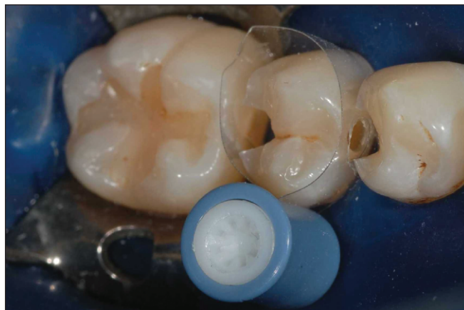
Figure 5. The modified transparent circular matrix was placed around tooth #20.