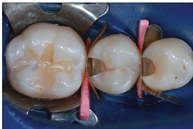
Figure 9. Sectional matrix and wooden wedges application on teeth #20 and 21.

sion checked and the restoration finished using the Ultradent Composite Finishing Kit (Ultradent Products). Initial polishing was performed with