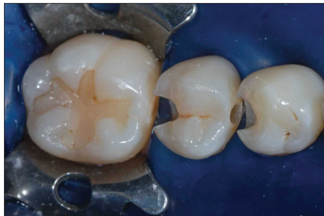
Figure 2. Cavity preparation on teeth #20 and 21 was completed; direct access to the mesial carious lesion was performed on tooth #20.