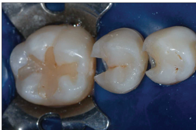
Figure 8. Final restoration of the direct access Class II restoration.