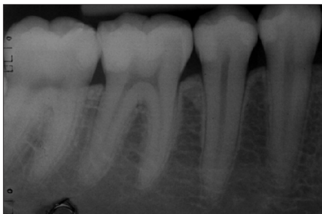
Figure 12. Post-operative radiograph showing excellent composite gingival adaptation on conventional and direct access Class II restorations.

Polishing System- Ultradent Products). The same procedure was completed for restorations on teeth #18 and #19 (Figure 11). Figure 12 shows the post-operative radiograph of the restored molar and premolars; composite gingival adaptation was achieved using both a conventional sectional matrix and modified circular matrix design.