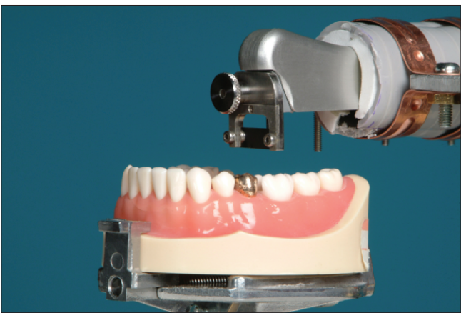
Figure 4: Measurement of PCT using the TPM.

Three measurement procedures were performed for each restoration. The final result of each measurement was the mean of these three consecutive measurements. A measurement failed when the outcome exceeded the maximum (pre-set) range of 0.5 N among the three measurements, for example, due to deformations of the strip or a non-parallel removal of the strip