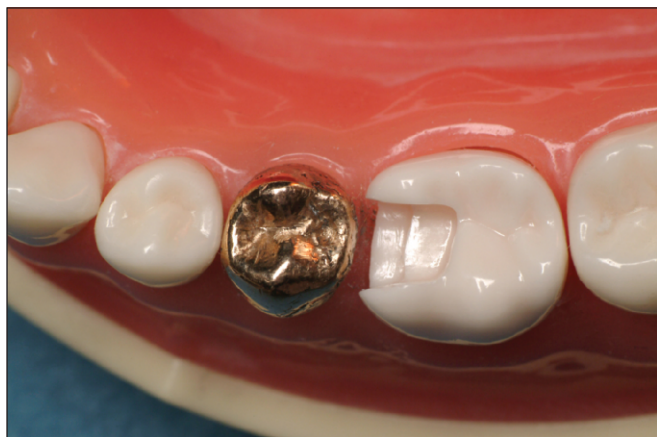
Figure 1: Prepared cavity in the lower left first molar and cast premolar used for all test groups in the current study.