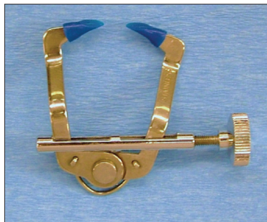
Figure 2: Elliot separator with modified beaks.