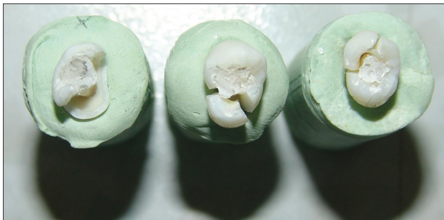
Figure 2. Occlusal view of three specimens following the fracture resistance test.

thetic restoration, it is well known that there is no therapy without any risks. When these methods are used correctly, there are only minor complications; therefore, there is clinical tolerability. 30