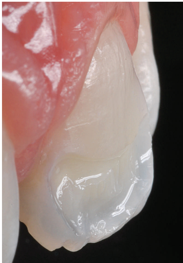
Figure 6. The proximal view demonstrates the cavity depth. Note the exposure of dentin.

After a prophylaxis, the enamel color was selected using the system scale positioned in the enamel not affected by the stain. Both the tooth and the color scale were hydrated and natural light was used.