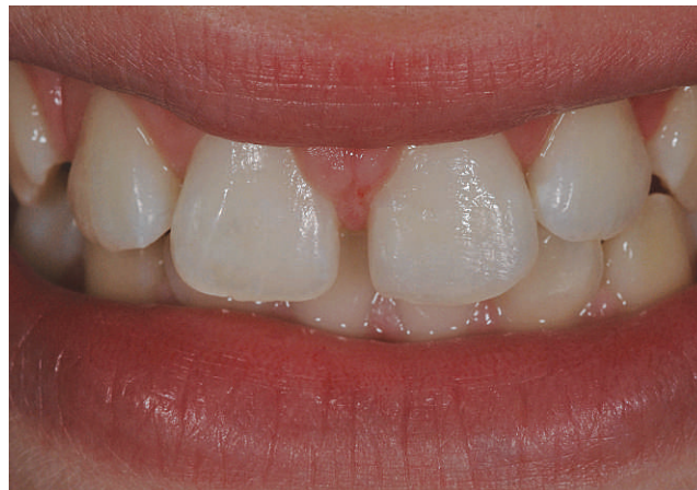
Figure 8. The final smile.

The procedure must be strictly controlled by the dentist, who should determine the appropriate method and timing of the treatment within the