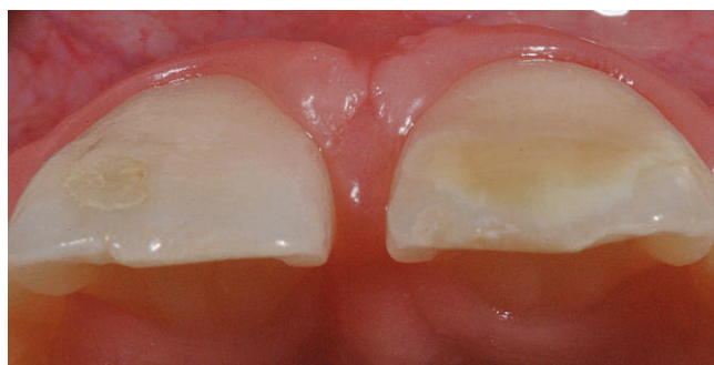
Figure 3. Incisal view of the upper central incisors. Observe that the teeth are not altered.

The mock-up of the restorations was performed seven days after completion of the bleaching. The