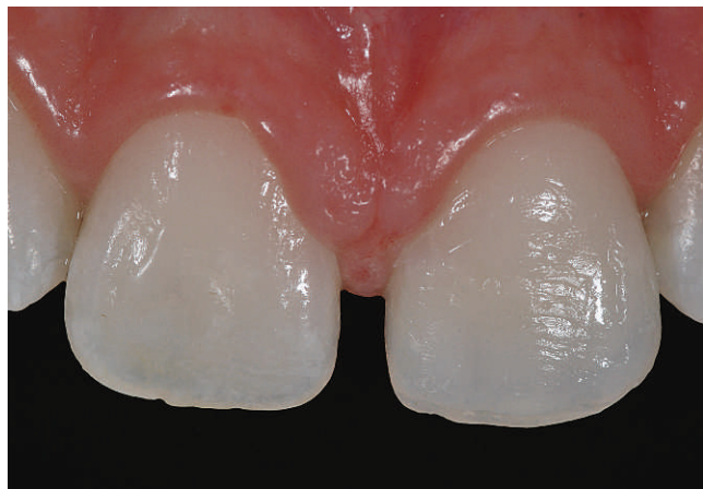
Figure 7. The final restorations.

Such accidents, relatively common in the first dentition, mainly at the incisors, can cause defects on the surfaces of the permanent successors. 13,14 These stains presented an increased opacity and an amber pigmentation in the contour but no changes in the surface texture.