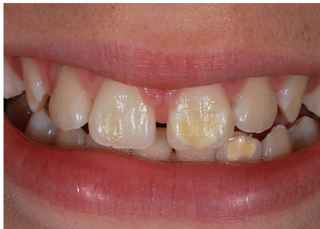
Figure 1. The patient's smile before treatment. Observe the presence of hypoplastic white spots in the anterior teeth.

Composite resin is a restorative material alternative that may restore esthetics with high quality, minimal wear, and durability. The necessity of whitening before providing restorative care should