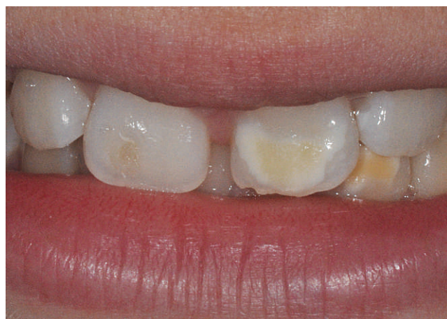
Figure 5. The upper incisors after the bleaching treatment. The home bleaching was performed only for these four teeth. Observe the increase in color homogeneity.

Empress Direct Resin System (Ivoclar Vivadent, Schaan, Liechtenstein), with different levels of translucency, was selected to reproduce the optical effects of the enamel, dentin, and incisal edges.