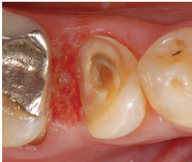
Figure 3. R2-technique: Placement of a direct resin composite restoration in the two-step technique. Step one (PBE): Clinical situation after gingivectomy (Elektrotom) and caries excavation. The proximal cavity margin is located below the CEJ next to the alveolar crest.

abandonment of a matrix, marginal overhangs could not be avoided. Subsequently, they were removed carefully with a rotary diamond instrument #128-130 (Flamme 128-130; Komet, Gebr. Brasseler GmbH & Co.KG) and a scalpel (Figure 7a).