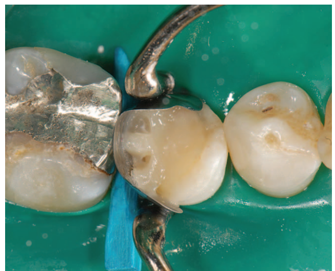
Figure 9. Occlusal view after removal of the proximal contact instrument. A tight proximal contact to the adjacent tooth is accomplished.

To obtain a tight proximal contact, a special hand instrument (OptraContact, Ivoclar Vivadent) was used (Figures 8 and 9). Final polymerization of both the flowable and the viscous composite resin was then completed with light at 800 \text{ mW/cm}^2 (40 seconds). Finally, the rubber dam was removed, the occlusion was checked, and the restoration was finished using the Astropol HP Finishing Kit (Astropol HP, Ivoclar Vivadent) (Figures 7b through 10). After the treatment session, the patient underwent oral hygiene training, and accurately fitting interdental brushes were chosen (Figure 11).