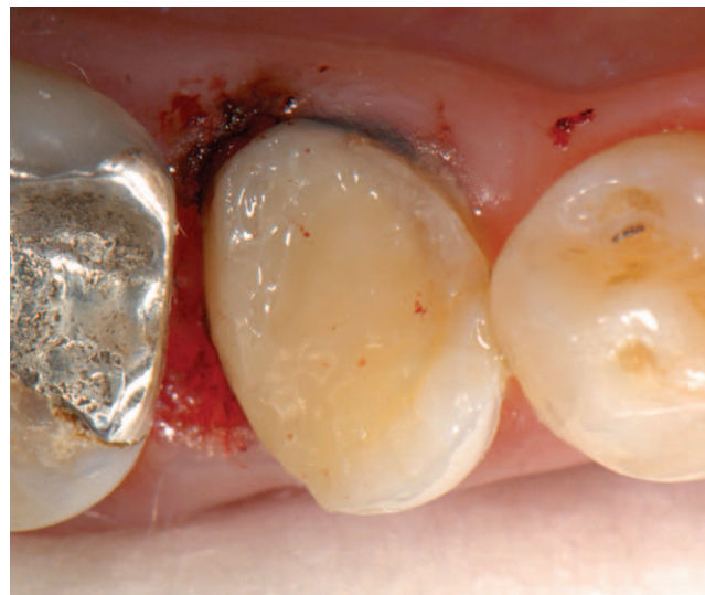
Figure 5. After etching, priming, and bonding, a layer of flowable composite was placed meticulously on the cavity margin, followed by a layer of viscous resin composite (both unpolymerized). After modeling and shaping both materials, the final light polymerization was carried out (Snowplough technique).

roughened by \text{Al}_2\text{O}_3 powder (50 \mu\text{m} , Kaltenbach & Voigt, Biberach, Germany). A sectional matrix (Palodent, Dentsply DeTrey, Konstanz, Germany) was inserted and fixed with a wedge and a separation ring. Between the PBE placed in step one and the sectional matrix, a narrow and sharp angled junction occurs. Etching and bonding steps were carried out using the same materials described previously.