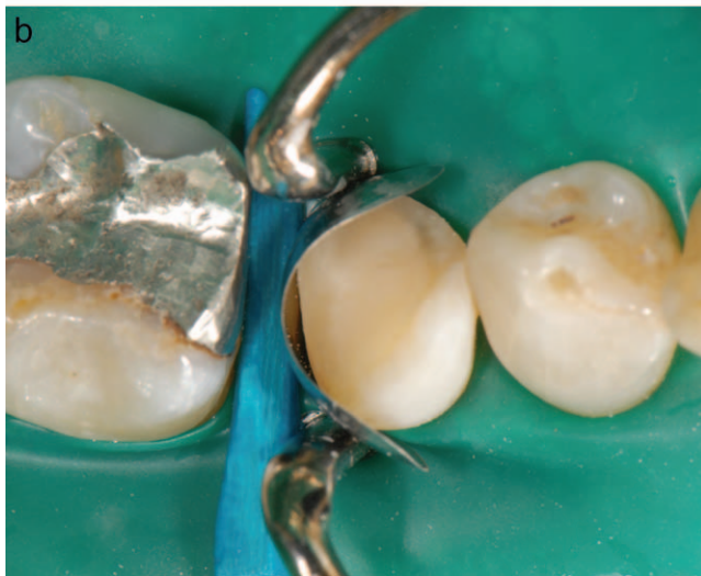
Figure 7. (a) Clinical situation after the PBE. The subgingival restorative margin was finished with rotary diamond instruments and a scalpel to remove overhangs and to create a smooth, planed, and nonirritating surface. (b) Step two: Occlusal view after application of the rubber dam, subsequent sandblasting with aluminium oxide, placement of a sectional matrix, wedging, and application of a separation ring.

The composite resin was applied using the Snowplough technique (Figure 6).