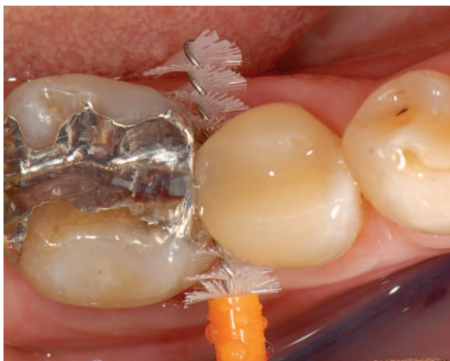
Figure 11. Postoperative view showing the selection of an accurately fitting interdental brush.

12-Month Recall —The clinical observation after 12 months revealed a vital tooth #45 with no inflammatory signs in the surrounding soft and hard tissue (Figure 13). Despite the fact that the biological width was clearly violated, the probing depths were 2 mm, and no bleeding occurred on probing (Figure 14). Radiographic examination revealed a distance of 1 mm between the restorative margin and the alveolar