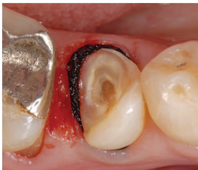
Figure 4. Application of a retraction cord. The cord could not be inserted fully into the sulcus because of the proximity of the alveolar crest. Subsequently, an astringent paste was applied for 2 min.

Step Two (direct composite resin restoration) —A rubber dam (Hygienic Dental Dam, Coltene Whale-dent, Langenau, Germany) was placed, and the previously placed PBE was cleaned carefully and