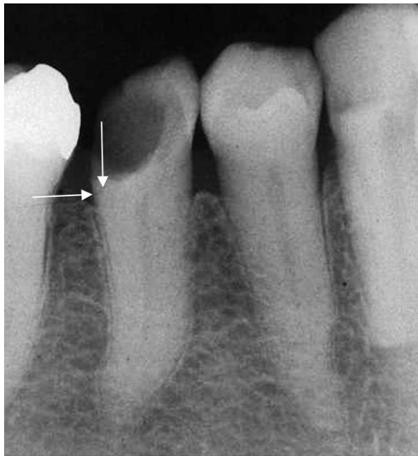
Figure 2. Preoperative x-ray of tooth #45. After excavation of caries, the proximal cavity margin is located close to the alveolar crest (arrow).

Step One (PBE) —All materials used are listed in Table 1. After local anesthesia, the excessive gingiva was removed using an electrosurgical unit (Elektrotom MD 62, KLS Martin GmbH & Co KG, Tuttlingen, Germany). Caries was removed with a bur (H1SEM 204.018-23, Komet, Gebr. Brasseler GmbH & Co.KG, Lemgo, Germany), and any sharp