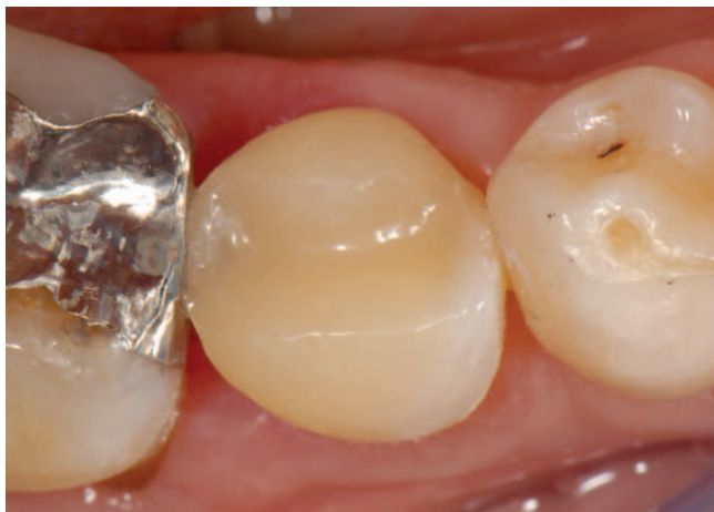
Figure 10. Clinical situation after removal of the rubber dam.

The postoperative radiographic examination of tooth #45 revealed that the proximal cavity margin was located adjacent to the alveolar bone crest and in close contact to connective tissue fibres of the dentogingival complex (distance 0.5–1.0 mm) (Figure 12).