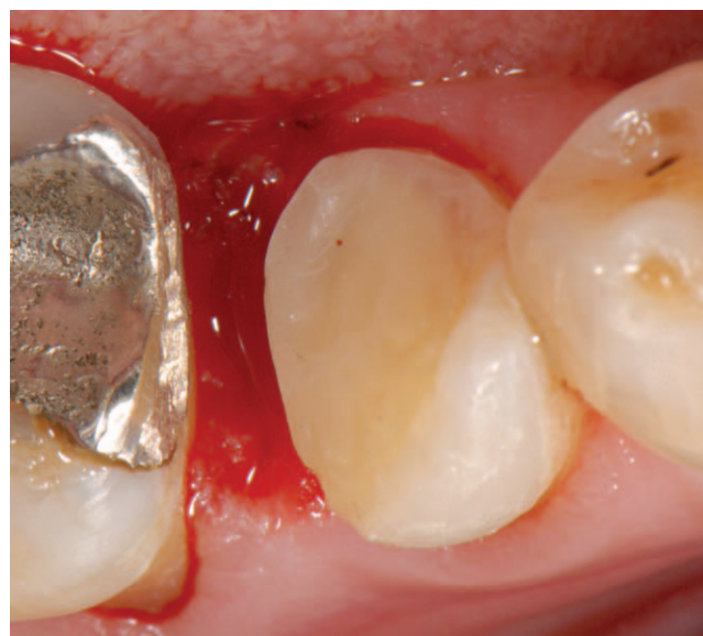
Figure 6. Schematic drawing of Snowplough technique: Note that in clinical practice there is a narrow and sharp angled junction between PBE placed in step one and the sectional matrix.

roughened by \text{Al}_2\text{O}_3 powder (50 \mu\text{m} , Kaltenbach & Voigt, Biberach, Germany). A sectional matrix (Palodent, Dentsply DeTrey, Konstanz, Germany) was inserted and fixed with a wedge and a separation ring. Between the PBE placed in step one and the sectional matrix, a narrow and sharp angled junction occurs. Etching and bonding steps were carried out using the same materials described previously.