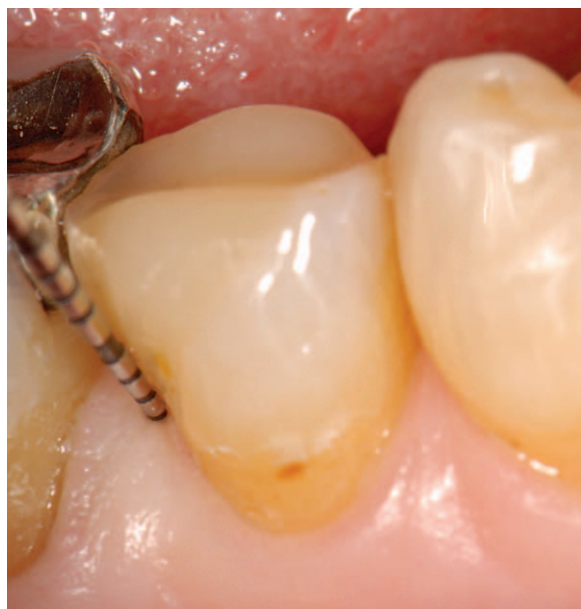
Figure 14. Buccal view after 12 months. The probing pocket depths in the proximal area were 2 mm, and no bleeding occurred on probing.

The Snowplough technique contributes essentially to achieving a homogenous and nonporous restoration-tooth interface. It is described as the combined use of a flowable composite and a viscous composite resin molded together in an unpolymerized state, followed by final polymerization of both materials (Figure 6). 17