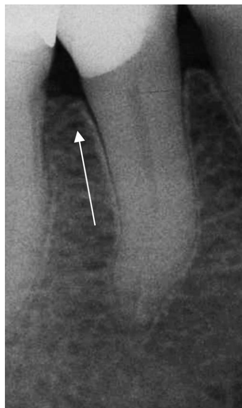
Figure 15. Radiograph of tooth #45 after 12 months. Radiographic examination revealed a distance of 1 mm between the restorative margin and the alveolar crest. Minimal loss of alveolar bone can be observed after 12 months (arrow).

In the clinical case presented, the occluso-proximal restoration margin was located below the CEJ and invaded the biological width. However, no adverse reactions, such as chronic inflammation of soft and hard tissues, attachment loss, or bone resorption, were observed at the 12-month follow-up.