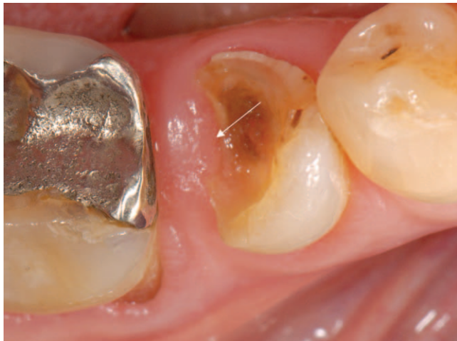
Figure 1. Preoperative view of tooth #45 with occluso-proximal decay and loss of restoration a few weeks before R2-technique was performed. Gingival overgrowth is seen on proximal cavity margin (arrow).

Step One (PBE) —All materials used are listed in Table 1. After local anesthesia, the excessive gingiva was removed using an electrosurgical unit (Elektrotom MD 62, KLS Martin GmbH & Co KG, Tuttlingen, Germany). Caries was removed with a bur (H1SEM 204.018-23, Komet, Gebr. Brasseler GmbH & Co.KG, Lemgo, Germany), and any sharp