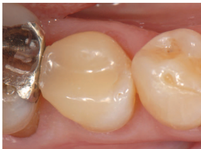
Figure 13. Clinical situation after 12 months: occlusal view.

dam is placed. After this critical part of the cavity is taken care of separately, a rubber dam can be placed much easier in step two of the restorative procedure, as described previously. 5