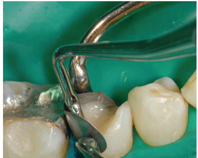
Figure 8. Composite resin is applied using the Snowplough technique. To obtain a tight proximal contact, a special hand instrument was used to separate the teeth during light polymerization.

A small amount of flowable composite resin (Tetric Evo Flow, Ivoclar Vivadent) was applied on the bottom of the cavity and gently dispersed with a dental probe for nonporous adaptation. The non-polymerized flowable resin should cover the sharp angled junction between the cavity margin and sectional matrix completely. On top of the non-polymerized layer of flowable resin, small amounts of viscous composite resin were applied (Tetric Evo Ceram, Ivoclar Vivadent) and gently pressed into the flowable resin using a hand instrument. In this way, the composite resin was adapted tightly to the cavity surface, resulting in a nonporous restoration–tooth interface.