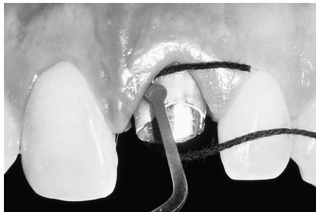
Figure 3. Insertion of 000 cord in the sulcus.

first, a “000” cord was positioned at the bottom of the gingival sulcus (Ultrapack Cord, Ultradent Products Inc, South Jordan, UT, USA). Subsequently, a “1” cord was placed over the first one (Ultrapack Cord). Before cord insertion, anesthetic Oraquix gel was applied in the sulcus of TG patients, left in situ for 30 seconds according to the manufacturer’s instructions, and then cleaned out with abundant water irrigation. The same procedure was performed for the CG in which a chlorhexidine digluconate gel was applied instead of the Oraquix gel. After 10 minutes of gingival displacement, the second cord was removed, and the definitive impression was taken with a polyether material (Impregum Penta Soft, 3M ESPE, St Paul, MN, USA) For each patient, sex, age, use of Oraquix, number of teeth examined, sulcus depth, bleeding during cord insertion, and pain experienced during the procedure were recorded (Figures 1–4).