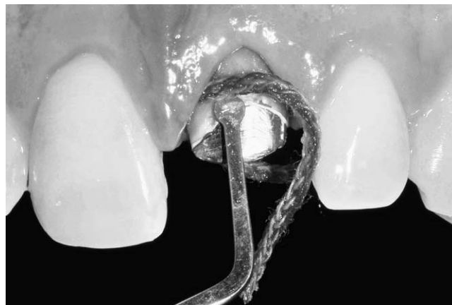
Figure 4. Insertion of 1 cord in the sulcus.

Patients were assigned to one of the two treatment groups using a computer-generated randomization table. All patients participated in the study with a