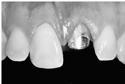
Figure 1. Tooth prepared for receiving full coverage restoration with vertical finishing line.

between the groups (test and control) of 1 (VAS unit) with a standard deviation of 0.91.