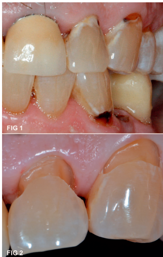
Figure 1. Initial root caries.

The tooth shade was determined to be A3. Anesthesia was attained by infiltration with lidocaine HCl 2% with epinephrine 1:100,000 (Xylocaine, Septodont, Lancaster, PA, USA). Isolation was done with cotton rolls. Ultrapack retraction cord #00 (Ultradent Products, Inc, South Jordan, UT, USA) was placed in the facial gingival sulcus during cavity preparation because the lesion was at the level of the gingiva. Cavity preparation was initiated with a No. 2 carbide bur (SS White, Lakewood, NJ, USA) using a high-speed handpiece under constant water cooling, and caries removal was completed with a No. 6 latch-type carbide bur at slow speed (Figure 2).