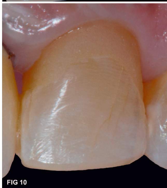
Figure 9. Final restoration.