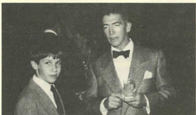
Recruiting new young blood into the Academy.