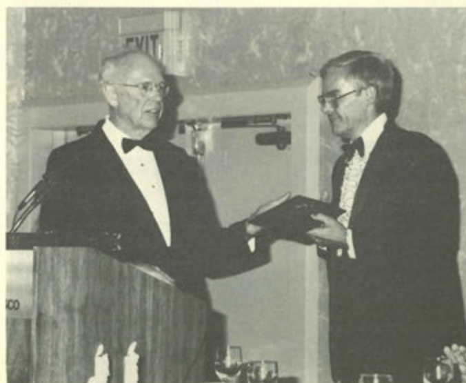
Presentation of Past-President's plaque.