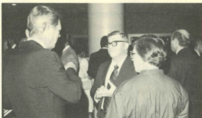
A naval encounter of the best kind.