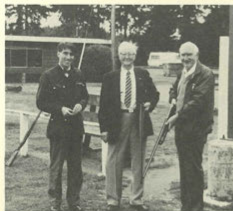
Serious Sport Afoot.