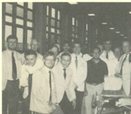
Entire cast: Faculty and students.