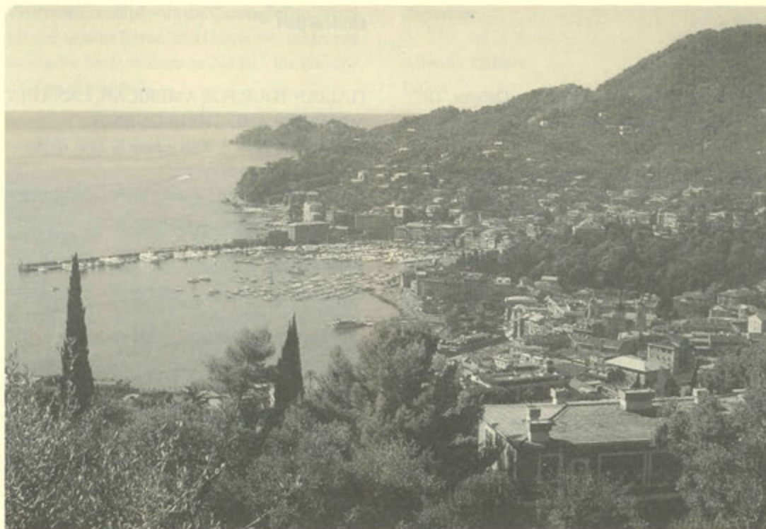
S. Margherita Ligure, the city of the meeting.

Santa Margherita Ligure - Genova May 31 - June 1-2, 1991