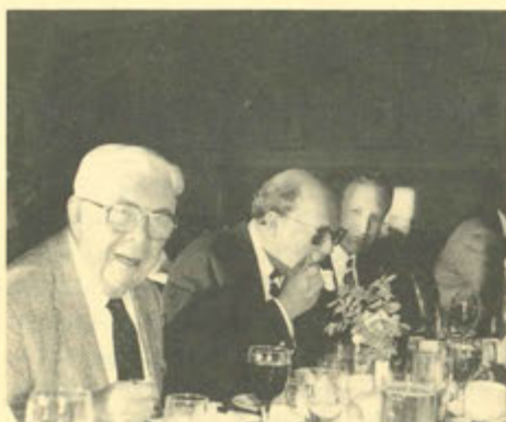
WILL IT GO?