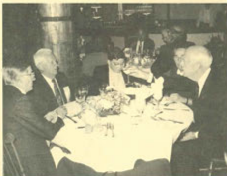
Woody raises a toast.