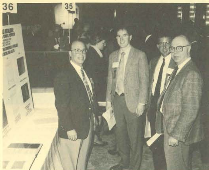
Friends at Cast Gold Table Clinic.