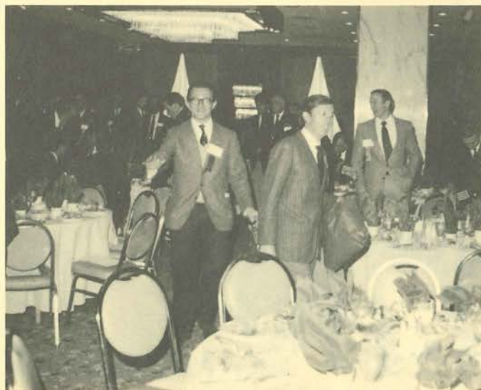
Our Italian Members head for lunch.