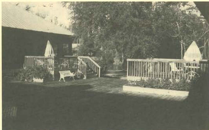
The Deck – site of Wednesday evening social.