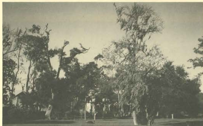
Local scene and vegetation.