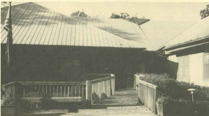
Entrance to the Cottages Conference Centre.