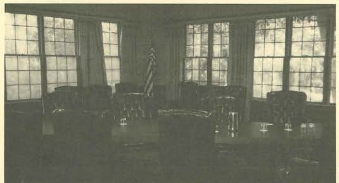
The Conference Room.