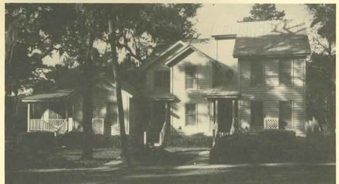
Typical villa: three units of 2 or 3 bedrooms.