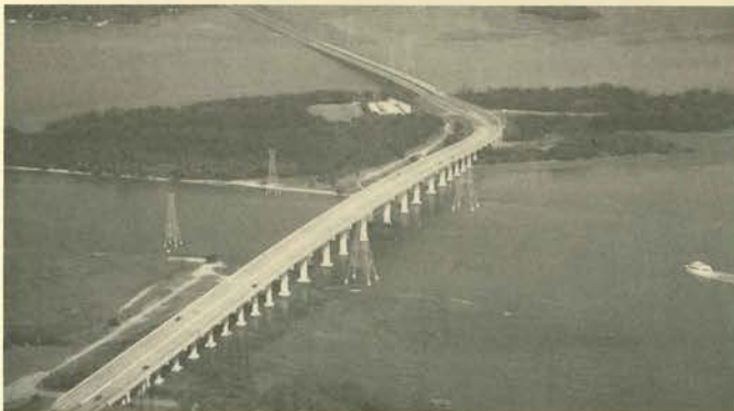
Bridge from the mainland over the Intra-coastal Waterway.