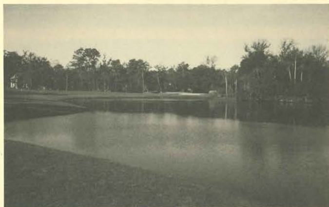
Hole #2 – across all that water.