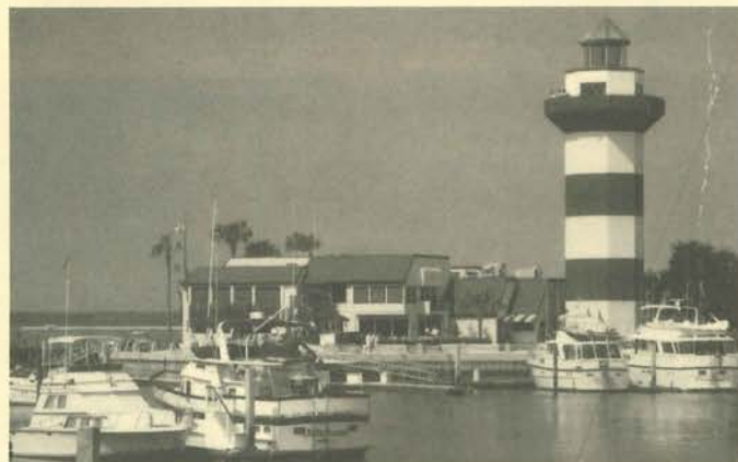
The famous lighthouse at Harbour Town.

NOTICE ASSOCIATED FERRIER GOLD FOIL COURSE Seattle September 16 to 20, 1996