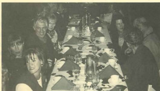
Dinner on the river.