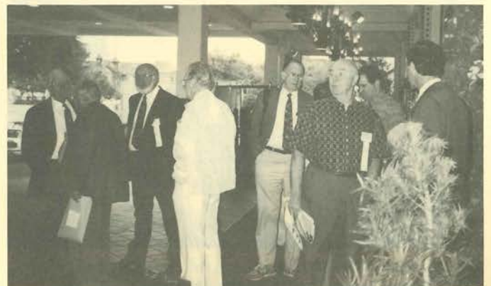
Waiting for the bus.