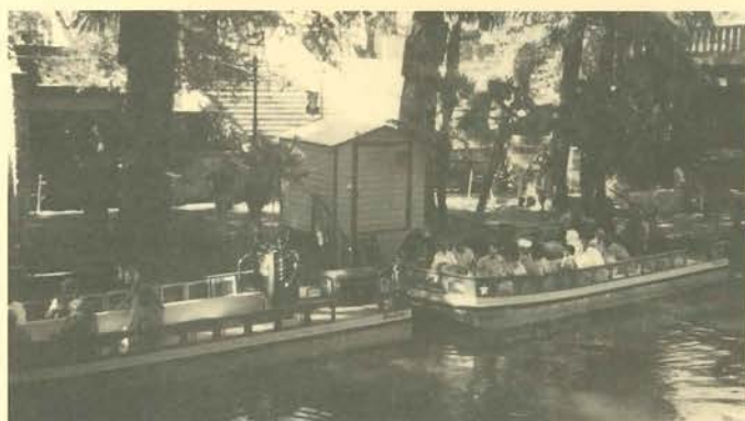
The river ran right past the hotel where we had dinner each evening.