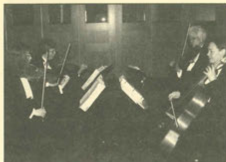
We were entertained by a string quartet.