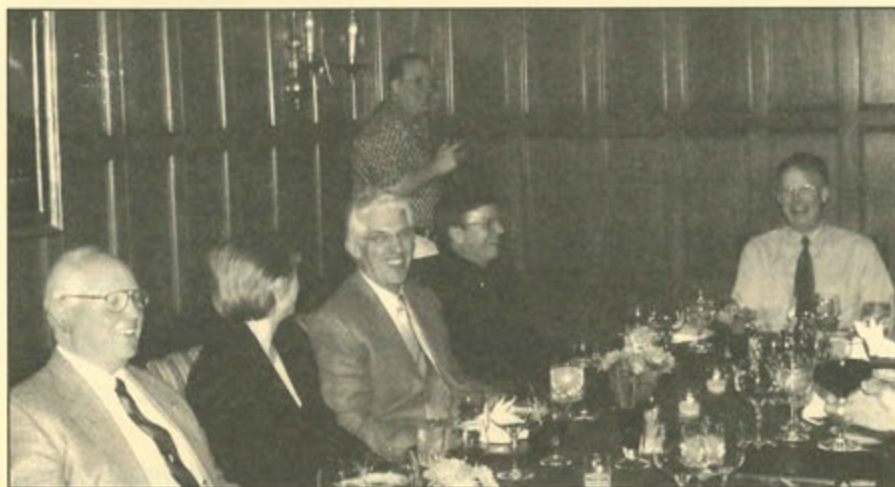
Thursday Evening Trustees Meeting