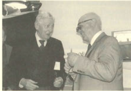
Oh! That's Rich!